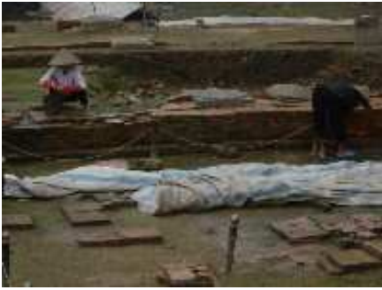
Workers (Section A)