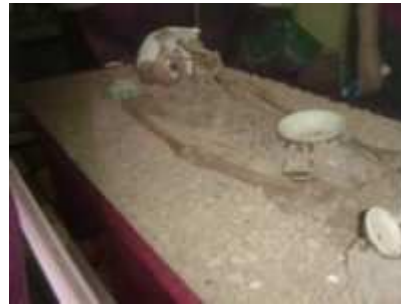
Skeleton and ceramics discovered on site