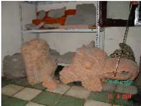
Dragon ridge ornament