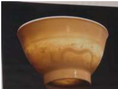
Fine ceramic bowl discovered on site