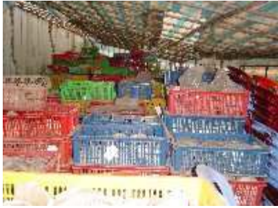
Open air artefact storage shed