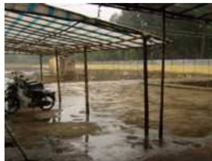
Problem of site drainage in heavy Hanoi rainfall