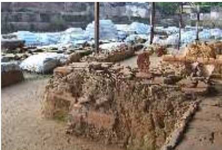
View to north-west from Section C