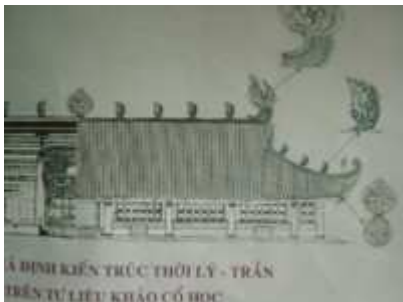
Conjectural reconstruction of pavilion based on archaeological discoveries