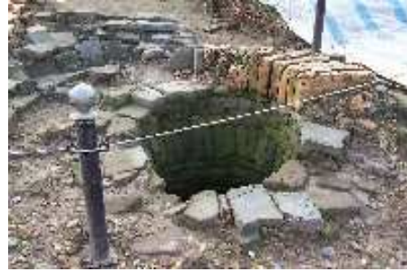
Well from pre Thanh Long period (7-9th centuries)