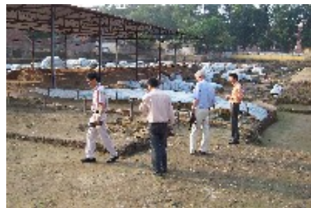
Site visit 13-04-2004