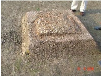
Pavilion pillar base of compacted gravel