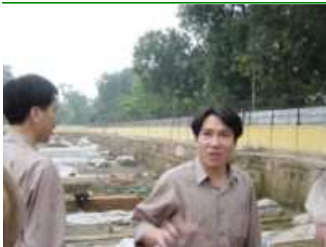
Archaeological Project Director (Section A)