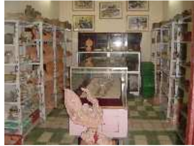
Storage for more valuable discoveries