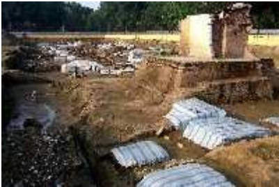
Surviving property still unexcavated (Section B)