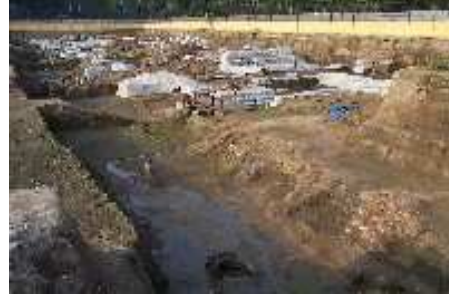
Drainage problems in Hanoi's high rainfall (Section A)