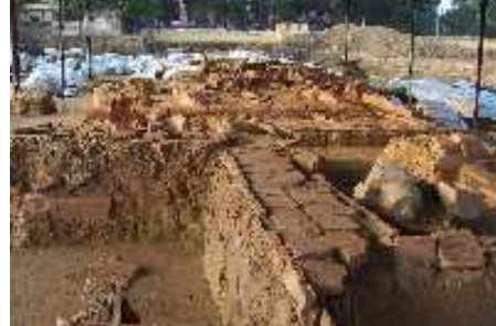
View towards northern boundary from Section C