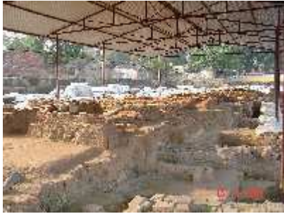
Covered section of the site. There is a proposal to cover the entire site.