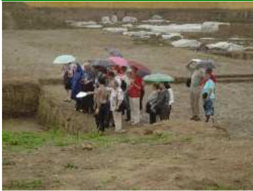
Linking Latitudes 2004 tour group caught in the rain (Section A 12-04-04)