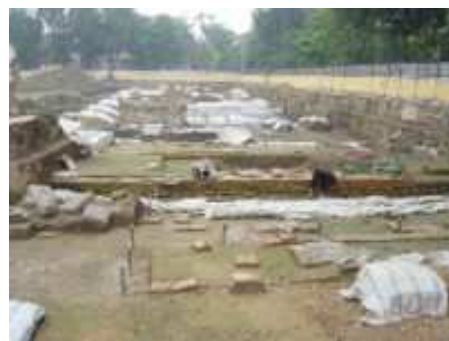
Plastic rain coverings (Section A)