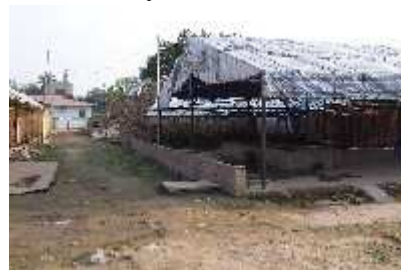
Storage area in unexcavated area