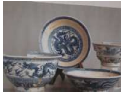
Early Le period royal ceramics discovered on site (15th century)